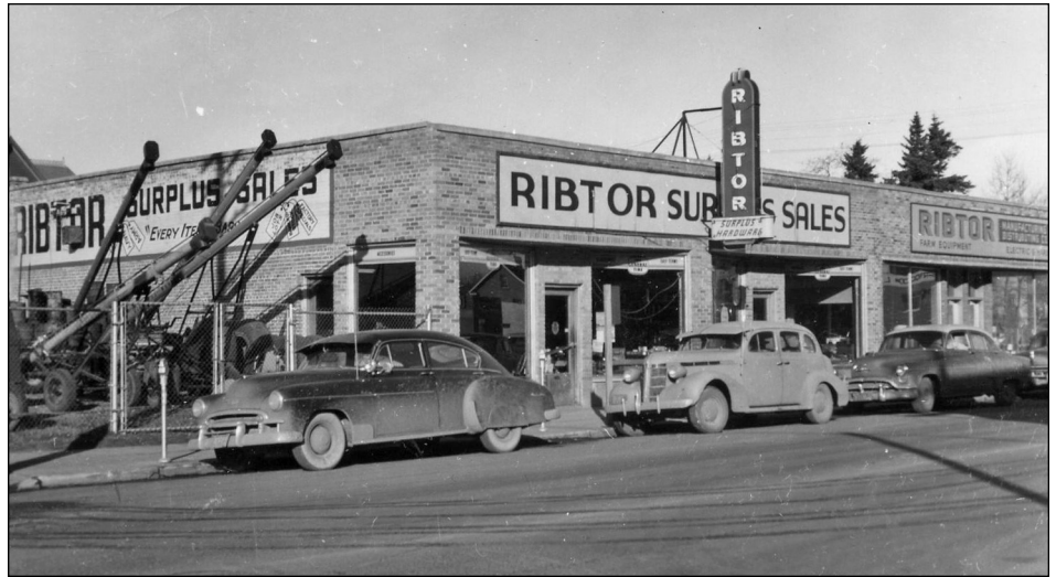
Old Ribtor building, 605 Second Avenue SE, 1954.