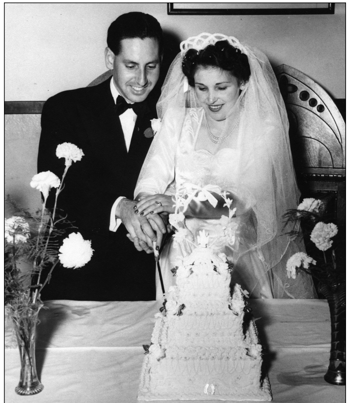
Wedding in the House of Israel, after 1945.