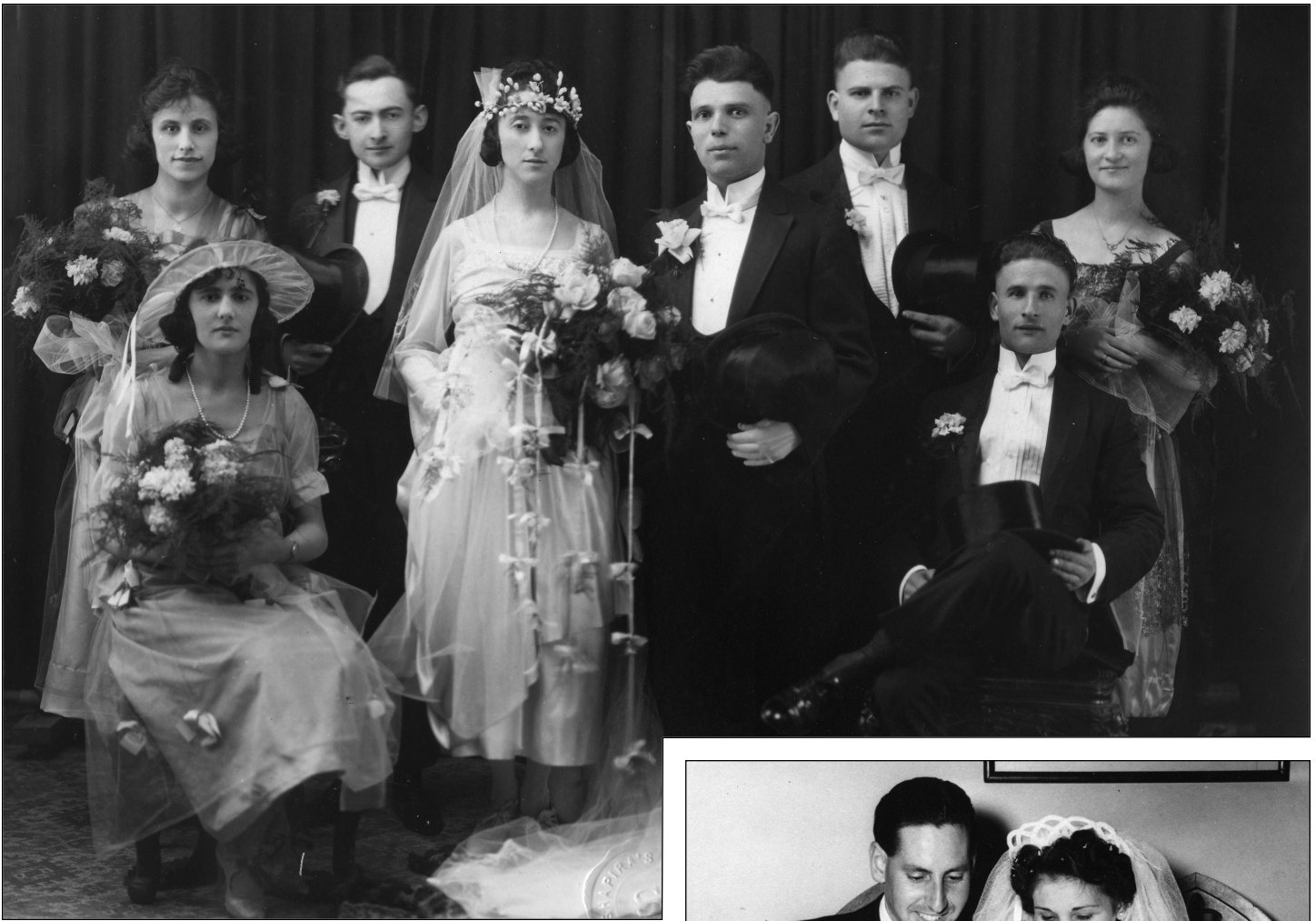
Wedding party in Winnipeg. There are other photos of the couple standing on the left in our files.

Please let us know if you have any further information about these photos from our collection.