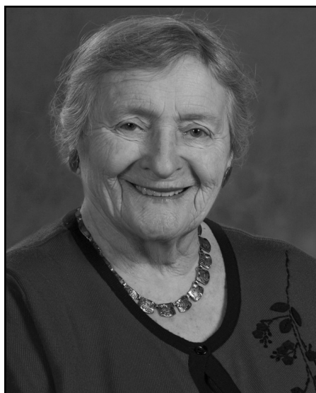
Chava Rosenfarb, 2006.