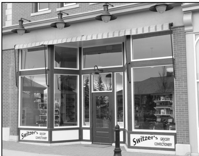
Switzer's Grocery, Heritage Park, Calgary, 2009.