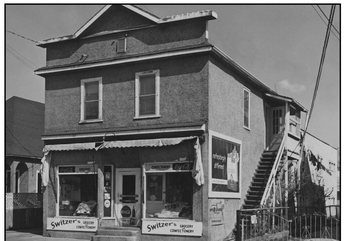
Switzer's Grocery, 112 - 14th Avenue SE, Calgary, c. 1949. Sam Switzer's first realty development, a small apartment building, is seen behind the store.