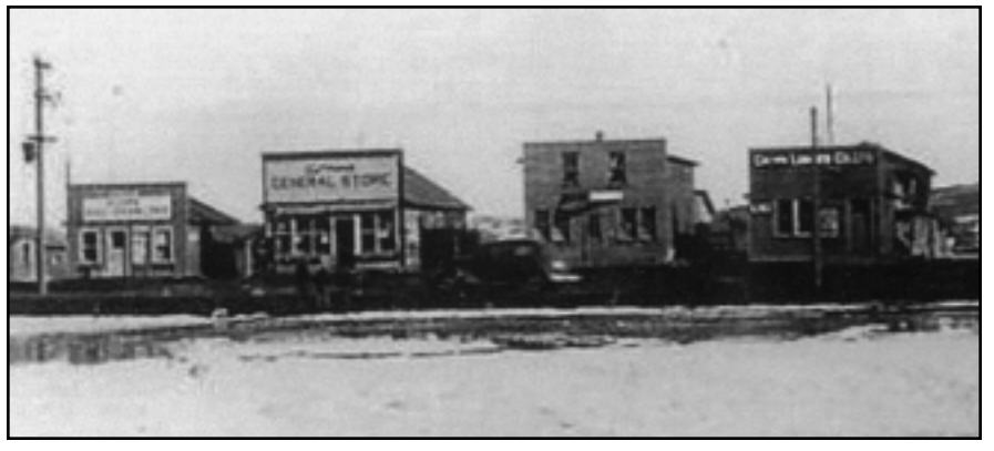
Main Street, Little Chicago, c. 1937. Gutman's General Store is second from left.