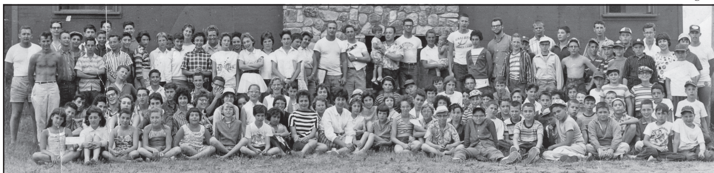
Camp B'nai Brith, 1959.